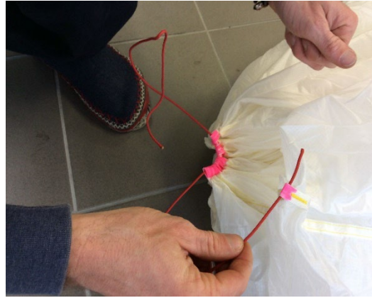
Sort out the suspension lines.