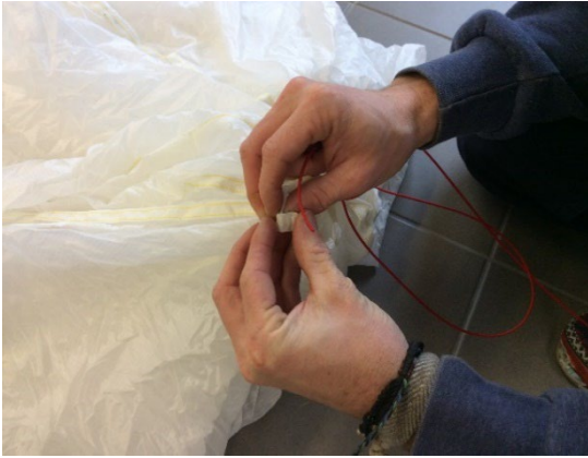
Attach the line to a stable fixed point.